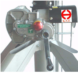
Manual operation with handle