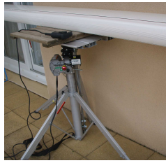
4 telescoping legs for uneven ground and Operation in confined space. Special design to work close to the wall