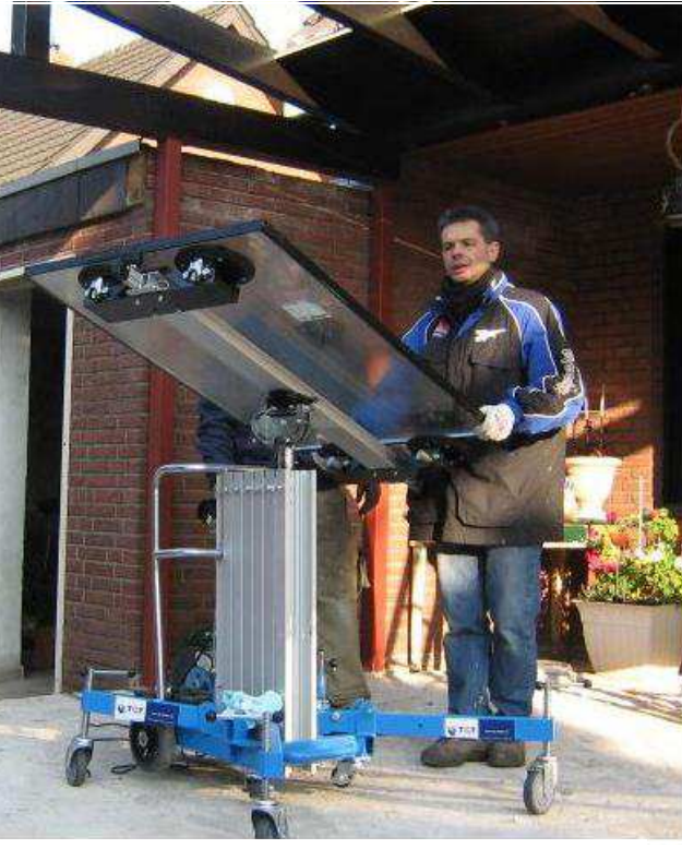
CA 400 GL With cradle for vertical lifting and 2 outriggers for glass up to 4 m