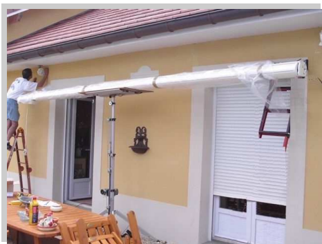
Other applications, installation of awnings or glass