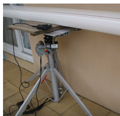
4 telescoping legs for uneven ground and Operation in confined space. and special design to work close to the wall