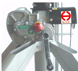
Manual operation with handle