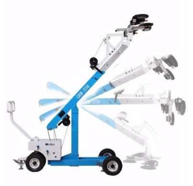
Easy micro-adjust for manipulate lifting Tilting by manual winch during handle the glass panel to different position