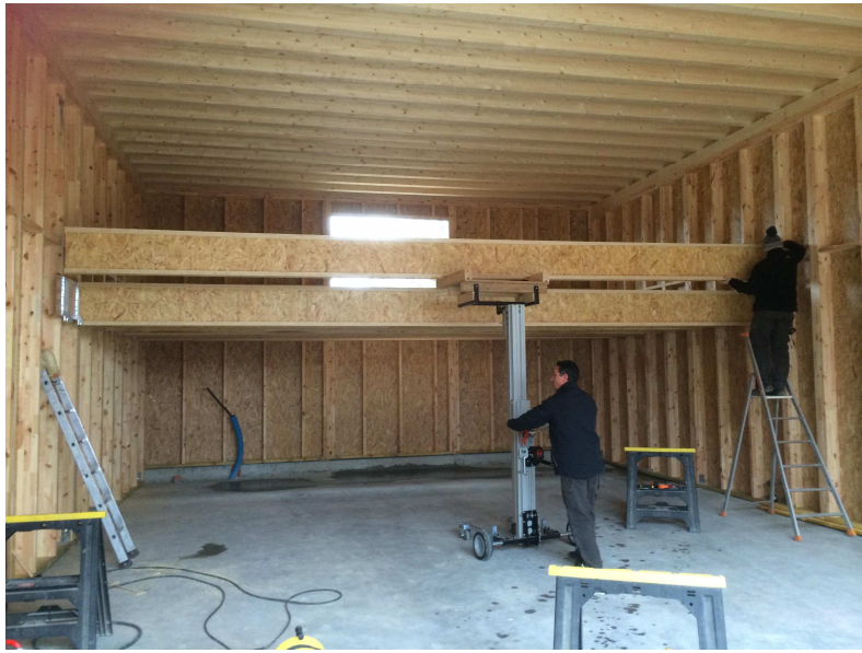
BD 1 mit wood beam180 kg - 7 m Lenght